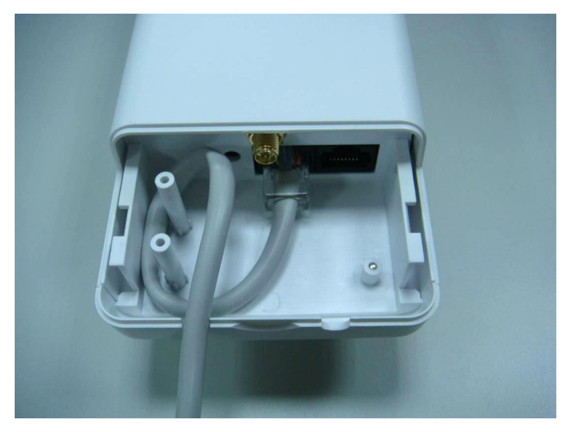
Step3: Install the upper housing and make sure the housing is well installed.

Step2: Pass through Ethernet cable from the hole; insert the cable to Secondary port. Note: RJ-45 8P8C Ethernet cable is required.