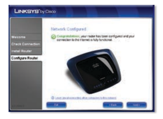
Congratulations! Setup is complete.

G. Follow the instructions until you see the Network Configured screen. Click on Learn about connecting other computers to this network to view sharing options, or click Next to finish the setup.