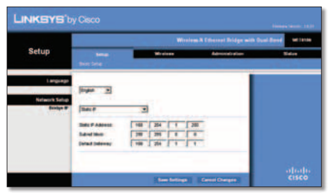
Setup > Basic Setup (Static IP)