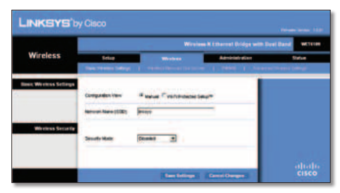
Wireless > Basic Wireless Settings (Manual)

Network Name (SSID) The SSID is the network name shared among all points in a wireless network. The SSID must be identical for all devices in the wireless network. It is case-sensitive and must not exceed 32 characters (use any characters on the keyboard). Make sure this setting matches the setting on your wireless router or access point. For added security, you should change the default SSID ( linksys ) to a unique name.