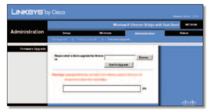
Administration > Upgrade Firmware

Use this screen to upgrade the Adapter's firmware. Do not upgrade the firmware unless you are experiencing problems with the Adapter or the new firmware has a feature you want to use.