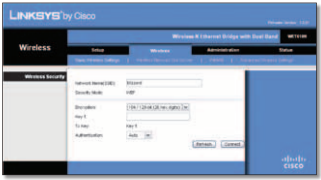
Wireless Network Site Survey > Wireless Security (WEP)

Network Name (SSID) The name of the network you selected is automatically displayed.