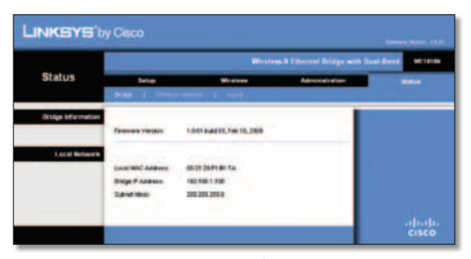
Status > Bridge

The Adapter's current status information is displayed.