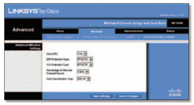
Wireless > Advanced Wireless Settings

Configure the Adapter's advanced wireless functions. These settings should only be adjusted by an expert administrator as incorrect settings can reduce wireless performance.