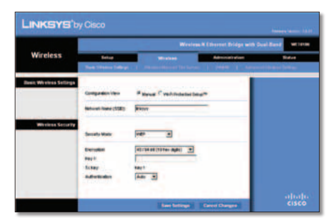
Security Mode > WEP

WEP is a basic encryption method, which is not as secure as WPA or WPA2.