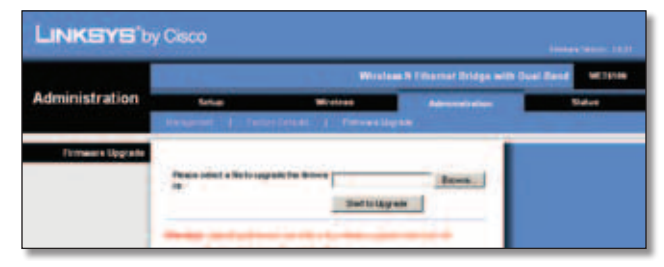
Administration > Factory Defaults

Restore All Settings To reset the Adapter's settings to the factory defaults, click Restore All Settings . Any settings you have saved will be lost when the default settings are restored.