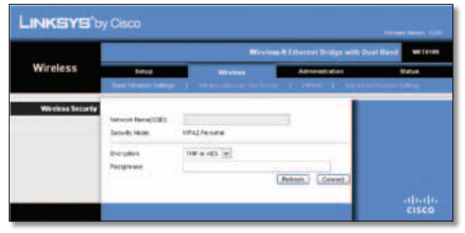
Wireless Network Site Survey > Wireless Security (WPA2)

Network Name (SSID) The name of the network you selected is automatically displayed.