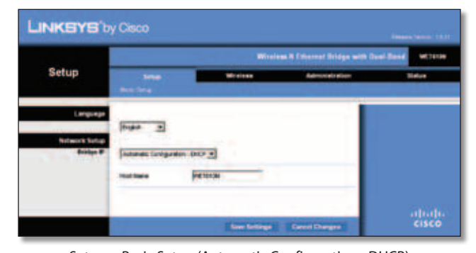
{\sf Setup} > {\sf Basic} \ {\sf Setup} \ ({\sf Automatic} \ {\sf Configuration} \ {\sf -DHCP})

The first screen that appears is the Basic Setup screen. Use this screen to change the web-based utility's language, or to change the Adapter's wired, Ethernet network settings.