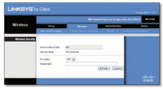
Wireless Network Site Survey > Wireless Security (WPA)

Network Name (SSID) The name of the network you selected is automatically displayed.