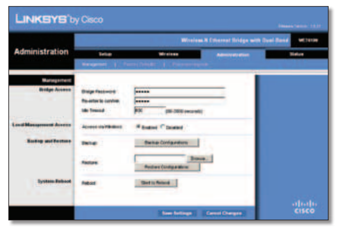
Administration > Management

Use this screen to manage specific Adapter functions: access to the web-based utility, backup of the configuration file, and reboot.