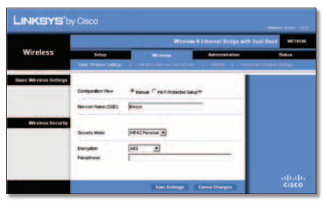
Security Mode > WPA2 Personal

WPA2 is a more advanced, more secure version of WPA.