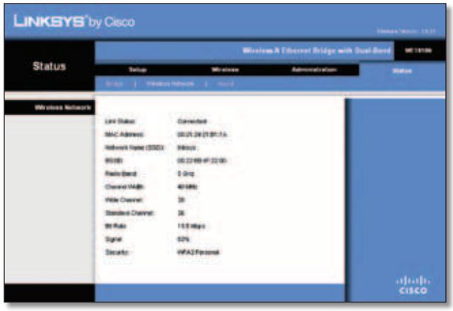
Status > Wireless

Information about your wireless network is displayed.