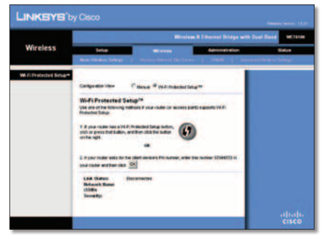
Wireless > Basic Wireless Settings (Wi-Fi Protected Setup)

There are two methods available. Use the method that applies to the router you are using.