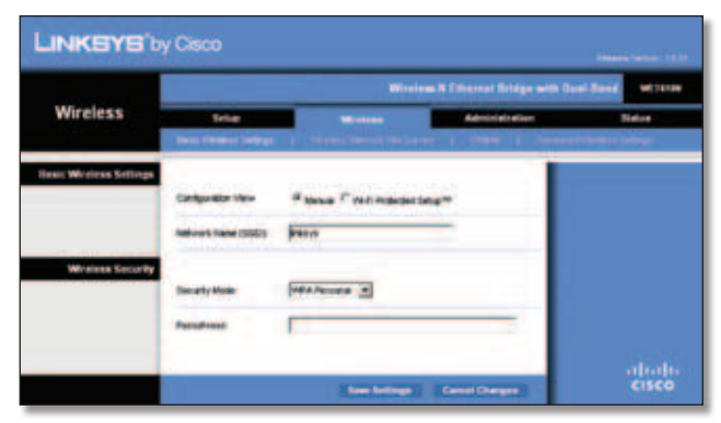
Security Mode > WPA Personal

WPA is a security standard stronger than WEP encryption.