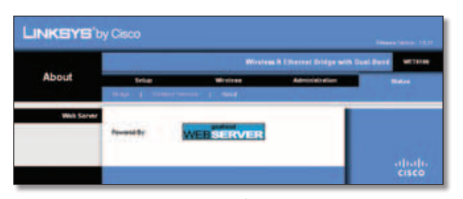
Status > About

Information about the web-based utility is displayed.