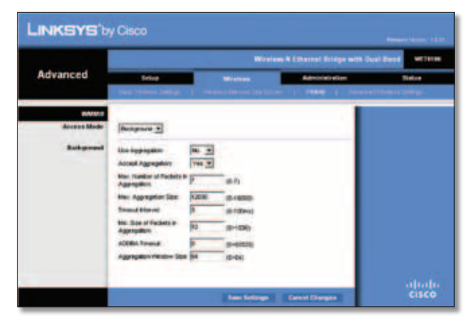
Wireless > WMM

Configure the Wireless MultiMedia (WMM) settings. WMM prioritizes packets depending on their respective access mode (traffic type): Background, Best Effort, Video, or Voice. These settings should only be adjusted by an expert administrator as incorrect settings can reduce wireless performance.