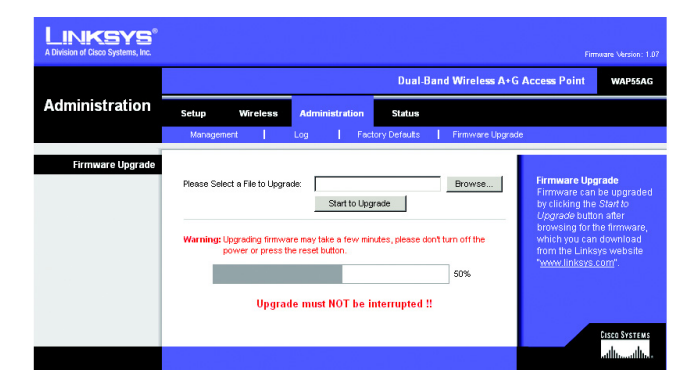
Figure C-1: Upgrade Firmware