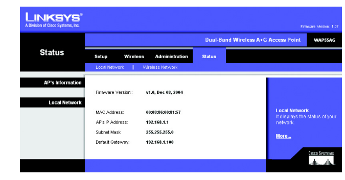
Figure 6-14: Status - Local Network

Default Gateway. This shows the Access Point's Default Gateway.