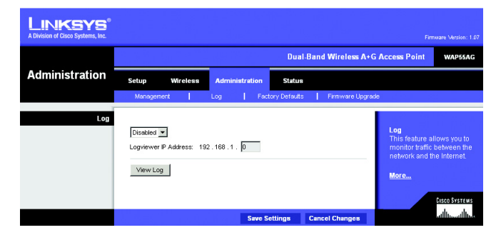
Figure 6-11: Log