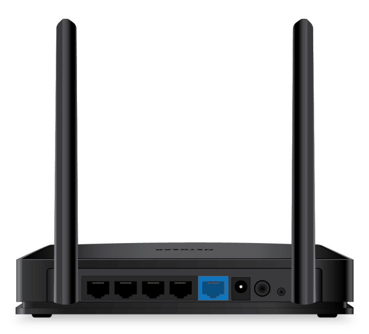
Figure 2. Router back panel

In addition to the two antennas, the back panel contains the following components: