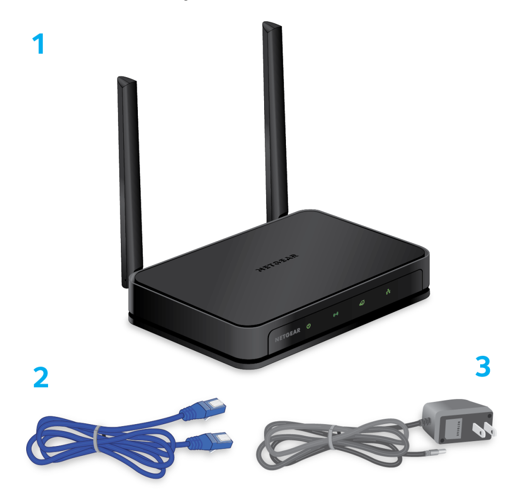
Figure 1. Package contents