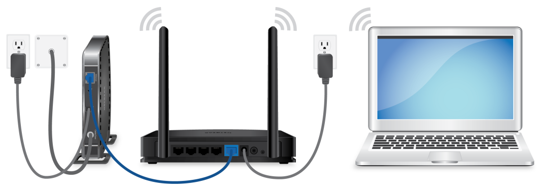
Figure 4. Router cabling

The following image shows how to cable your router: