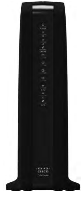
One DPC3929 DOCSIS Wireless Residential Voice Gateway

When you receive your residential gateway, you should check the equipment and accessories to verify that each item is in the carton and that each item is undamaged. The carton contains the following items: