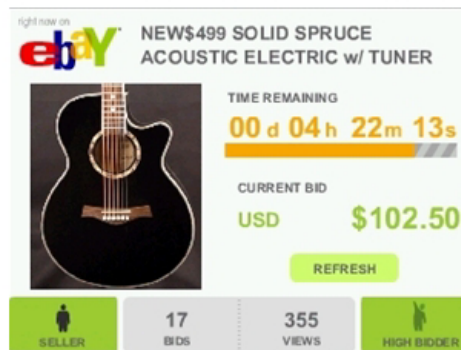
Keep a close eye on an auction item