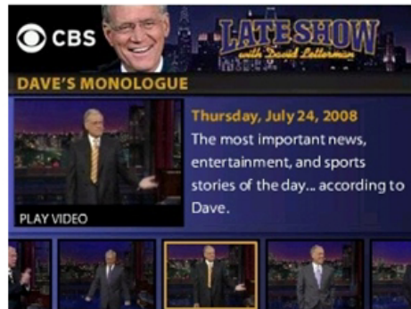
Feed your need for entertainment