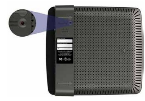
Your router's appearance may vary

Reset button—Press and hold this button for 5-10 seconds (until the port lights flash at the same time) to reset the router to its factory defaults You can also restore the defaults using the browser-based utility