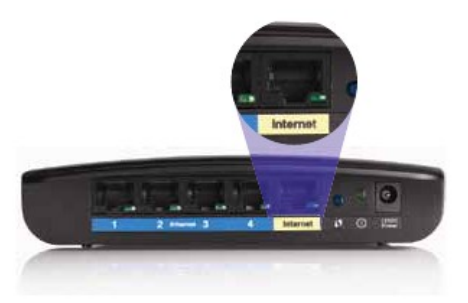
Back view of router

Make sure that an Ethernet or Internet cable (or a cable like the one supplied with your router) is securely connected to the yellow Internet port on the back of the router and to the appropriate port on your modem This port on the modem is usually labeled Ethernet, but may be named Internet or WAn