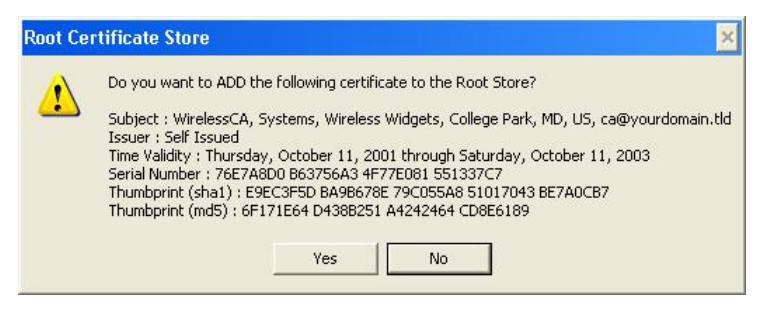
Figure 67: Root Certificate Screen