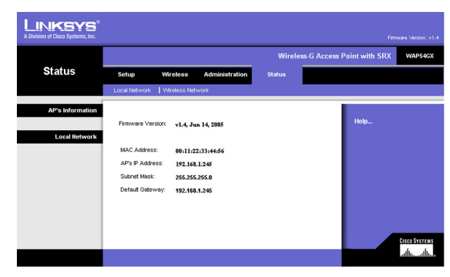
Figure 6-19: Status - Local Network Screen