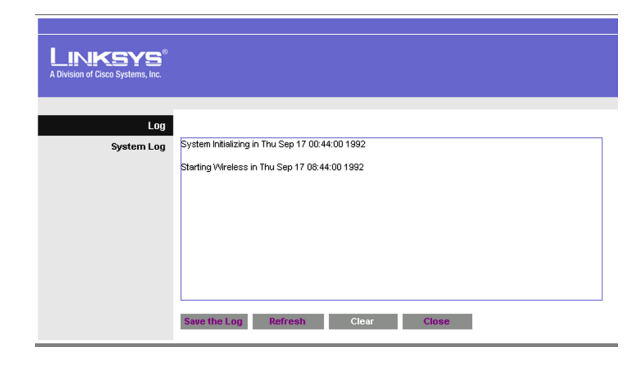
Figure 6-16: View Log Screen