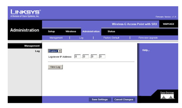
Figure 6-15: Administration - Log Screen

Change these settings as described here and click Save Settings to apply your changes, or click Cancel Changes to cancel your changes. Click Help for more information.