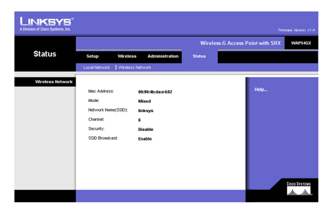
Figure 6-20: Status - Wireless Network Screen