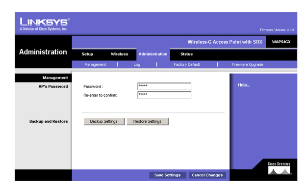
Figure 6-14: Administration - Management Screen

Change these settings as described here and click Save Settings to apply your changes, or click Cancel Changes to cancel your changes. Click Help for more information.