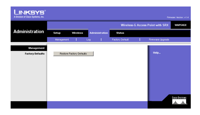
Figure 6-17: Administration - Factory Defaults Screen