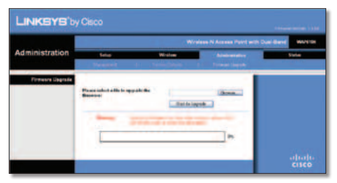
Administration > Firmware Upgrade

Use this screen to upgrade the Access Point's firmware. Do not upgrade the firmware unless you are experiencing problems with the Access Point or the new firmware has a feature you want to use.