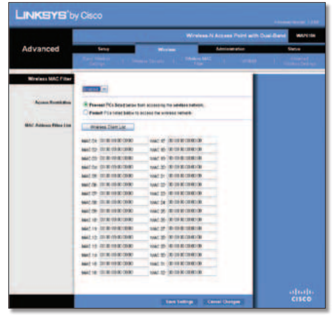
Wireless > Wireless MAC Filter

Wireless access can be filtered by using the MAC addresses of the wireless devices transmitting within your network's radius.