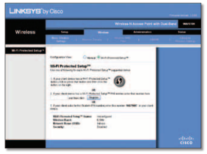
Wireless > Basic Wireless Settings (Wi-Fi Protected Setup)

There are three methods available. Use the method that applies to the client device you are configuring.