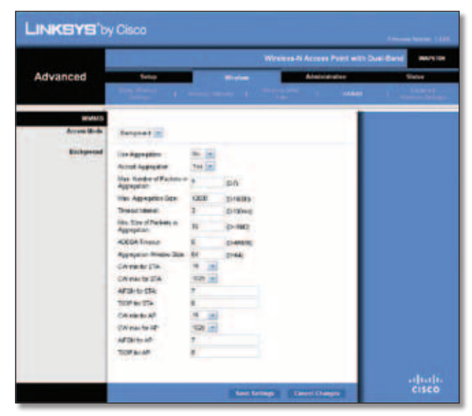
Wireless > WMM

Configure the Wireless MultiMedia (WMM) settings. WMM prioritizes packets depending on their respective access mode (traffic type): Background, Best Effort, Video, or Voice. These settings should only be adjusted by an expert administrator as incorrect settings can reduce wireless performance.