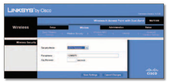
Security Mode > WPA Personal

WPA is a security standard stronger than WEP encryption.