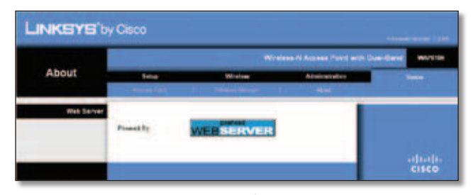
Status > About

Information about the web-based utility is displayed.