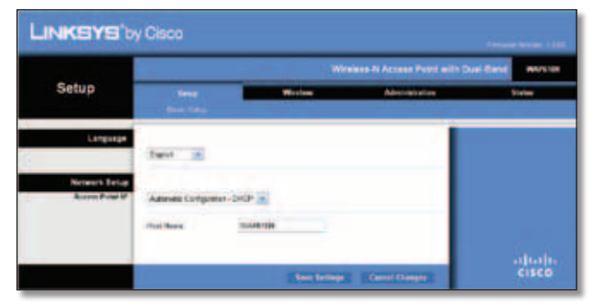
Setup > Basic Setup (Automatic Configuration - DHCP)

The first screen that appears is the Basic Setup screen. Use this screen to change the web-based utility's language, or to change the Access Point's wired, Ethernet network settings.