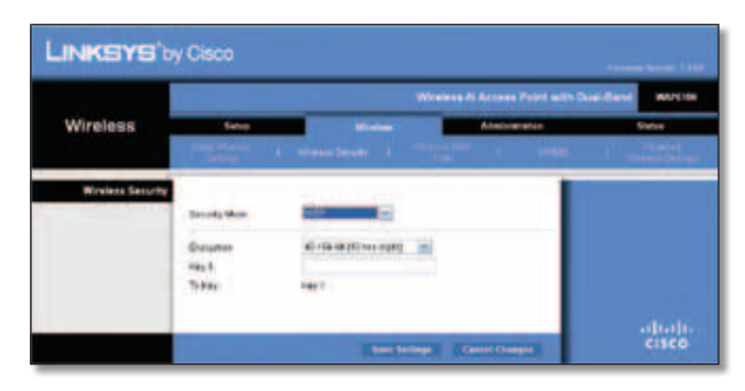
Security Mode > WEP

WEP is a basic encryption method, which is not as secure as WPA or WPA2.