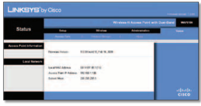
Status > Access Point

The Access Point's current status information is displayed.