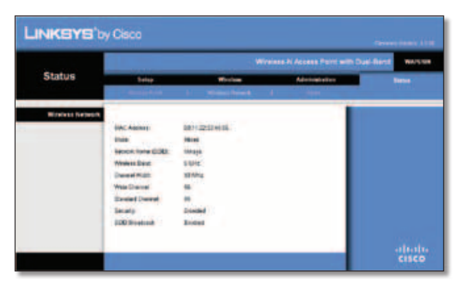
Status > Wireless Network

Information about your wireless network is displayed.