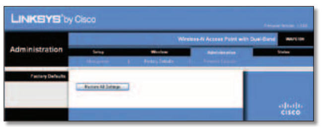
Administration > Factory Defaults

Restore All Settings To reset the Access Point's settings to the factory defaults, click Restore All Settings . Any settings you have saved will be lost when the default settings are restored.