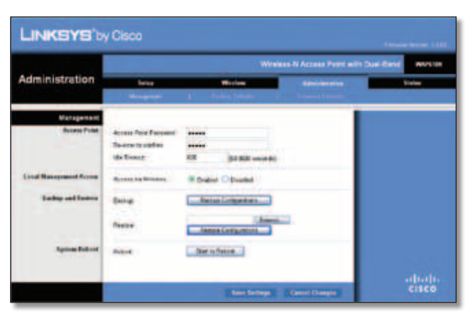
Administration > Management

Use this screen to manage specific Access Point functions: access to the web-based utility, backup of the configuration file, and reboot.