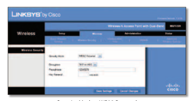
Security Mode > WPA2 Personal

WPA2 is a more advanced, more secure version of WPA.