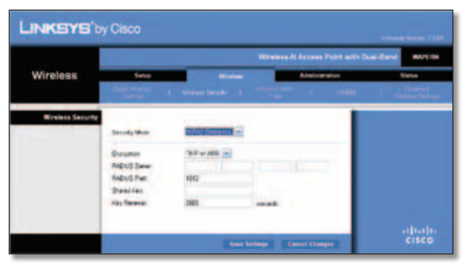
Security Mode > WPA2 Enterprise

This option features WPA2 used in coordination with a RADIUS server. (This should only be used when a RADIUS server is connected to the Router.)