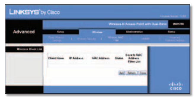
Wireless Client List

Wireless Client List Click this to open the Wireless Client List screen.