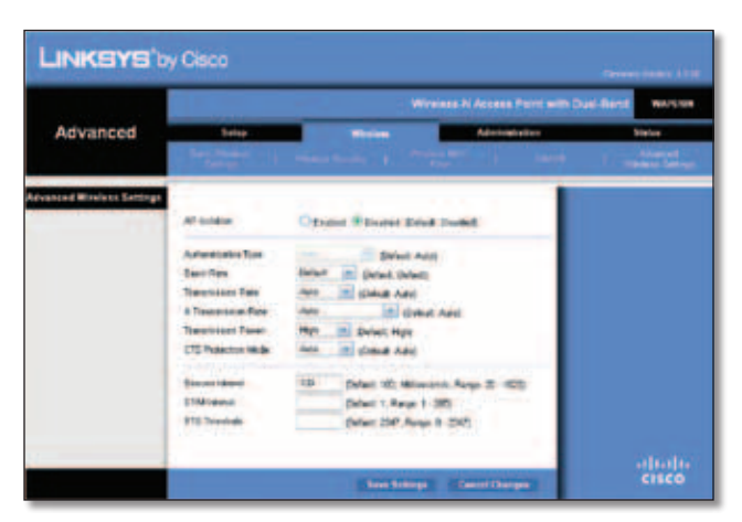
Wireless > Advanced Wireless Settings

Configure the Access Point's advanced wireless functions. These settings should only be adjusted by an expert administrator as incorrect settings can reduce wireless performance.