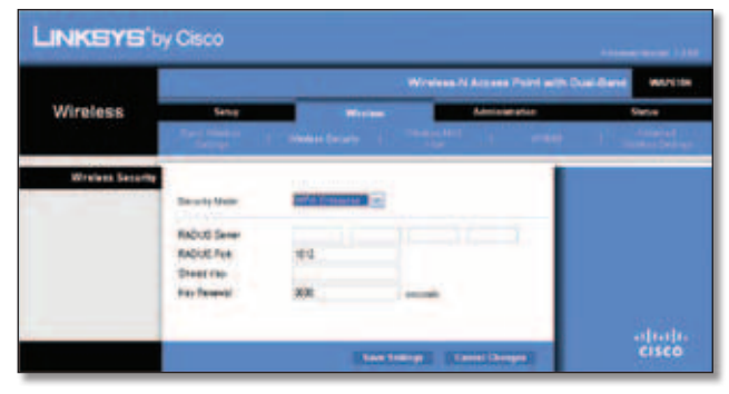
Security Mode > WPA Enterprise

This option features WPA used in coordination with a RADIUS server. (This should only be used when a RADIUS server is connected to the Router.)