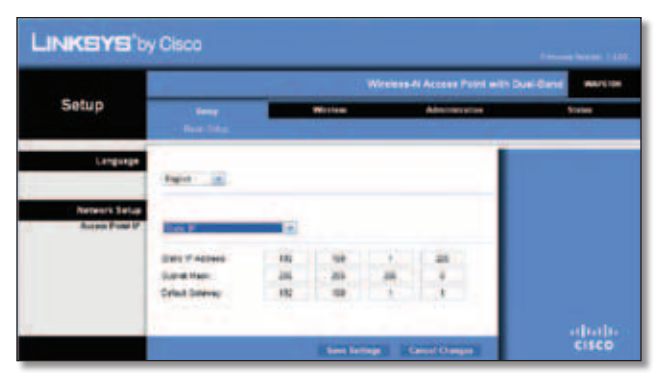
Setup > Basic Setup (Static IP)