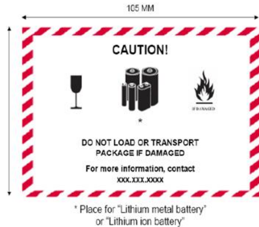
Figure 13: Shipping Labels for Smaller Packages for Batteries

The Class 9 label must be available for the proper limit battery weight per package (see Figure 14). This should be present on the pallets and master carton.