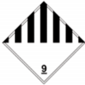
Figure143. Class 9 Hazard Symbol shipping label for batteries contained in the equipment.

The Class 9 label must be available for the proper limit battery weight per package (see Figure 14). This should be present on the pallets and master carton.