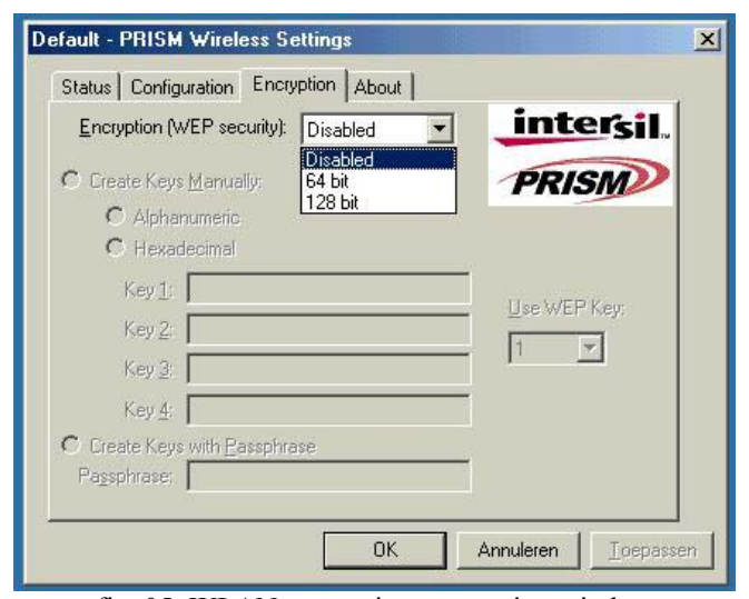
fig, 05: WLAN encryption rate setting window

h-select what encryption type is required, 64 or 128 bit WEP (default setting is disabled) see fig. 05.