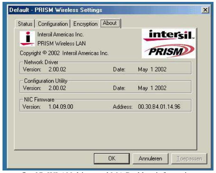
fig, 07: WLAN driver and MAC addres information

j-click on the about tab to see the software drivers versions and MAC address (fig.07).