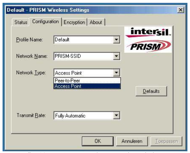
fig, 03: WLAN network type setting window

f-click on configuration tab and select which type of network is required (access point or Peer-to-peer mode), see fig. 03.