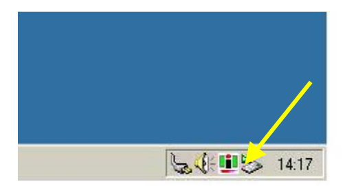
fig, 01: Intersil WLAN icon

d-the Intersil WLAN icon will appear in system tray on the bottom right of the screen (see yellow arrow in fig. 01)