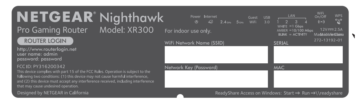
Figure 5. Router label

The router label on the router shows the login information, WiFi Network Name (SSID), network key (password), serial number, and MAC address.