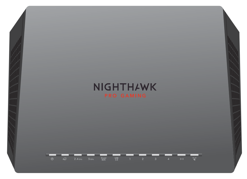
Figure 2. Top view

The status LEDs are located on the top panel of the router.