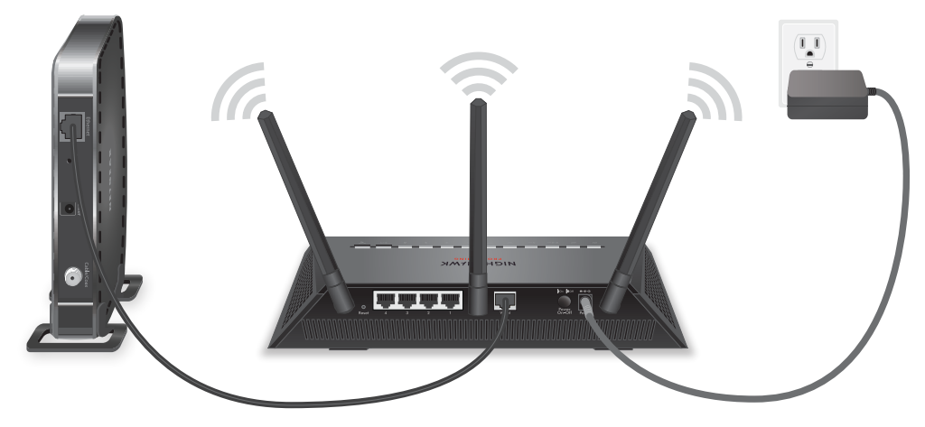
Figure 6. Cable your router

Power on your router and connect it to a modem.