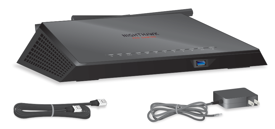
Figure 1. Package contents

Your package contains the Nighthawk Pro Gaming Router, the power adapter, and an Ethernet cable.