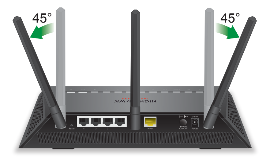
Figure 4. Position the antennas

For the best WiFi performance, we recommend that you position all of the antennas as shown in the following image.