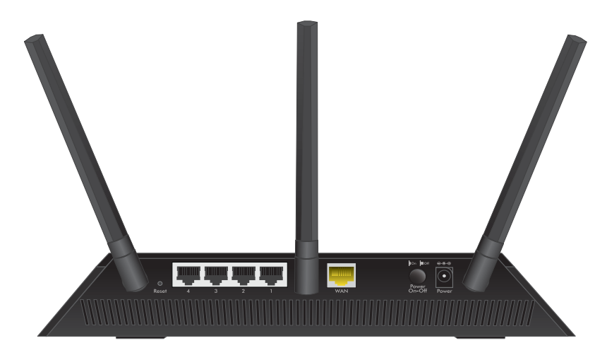
Figure 3. Rear panel

The following figure shows the rear panel connectors and buttons.