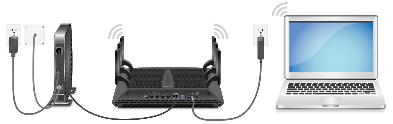
Figure 4. Cable your Router

The following image shows how to cable your router: