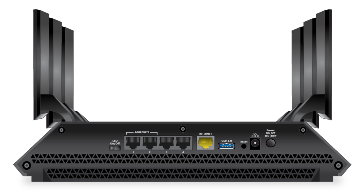
Figure 2. Router back panel

The following figure shows the rear panel connectors and buttons.