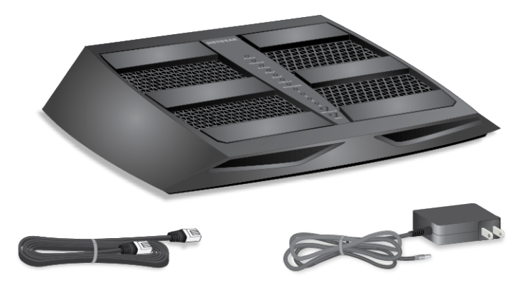
Figure 1. Package contents

Your package contains the router, the power adapter, and an Ethernet cable.