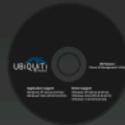
Installation CD 1 (Qty.)