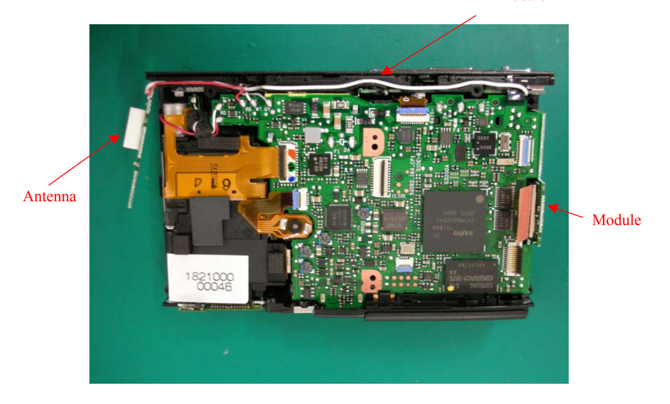
Fig3. Side view of "2143EB" be equipped for a digital camera (example)

Connector Cable between Antenna and Module