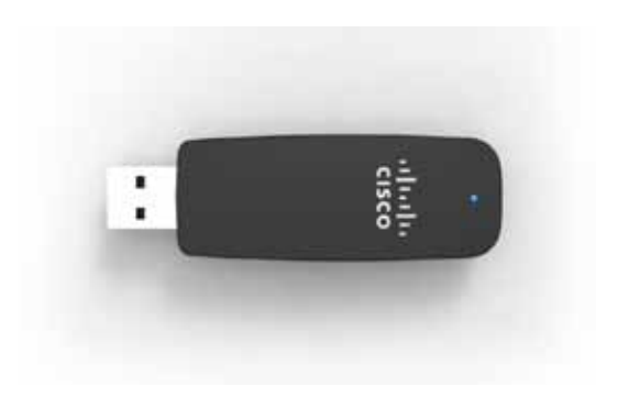
Link (Blue) The LED flashes when there is wireless network activity.