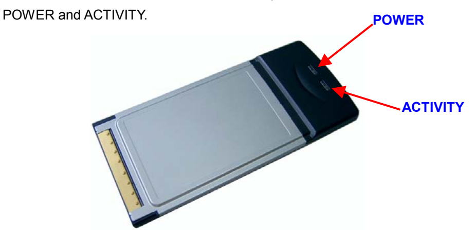
Figure 1-2 LDEs

The WCB-G03H Wireless Cardbus Adapter has two LEDs: