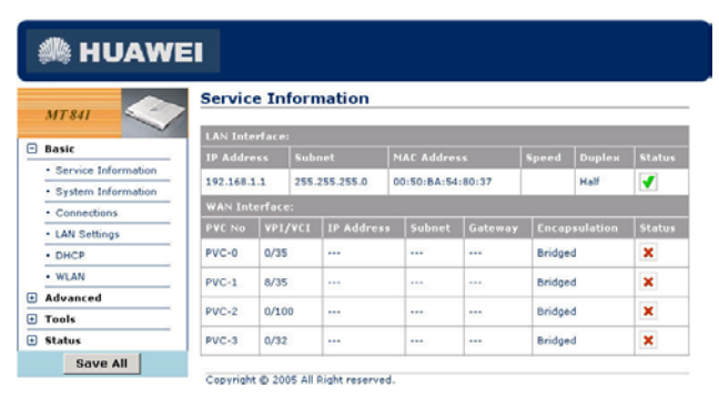
Figure 3-3 Layout of Web-based Configuration Manager

Click the WLAN of Basic in the Wizard Column to set the WLAN configuration.