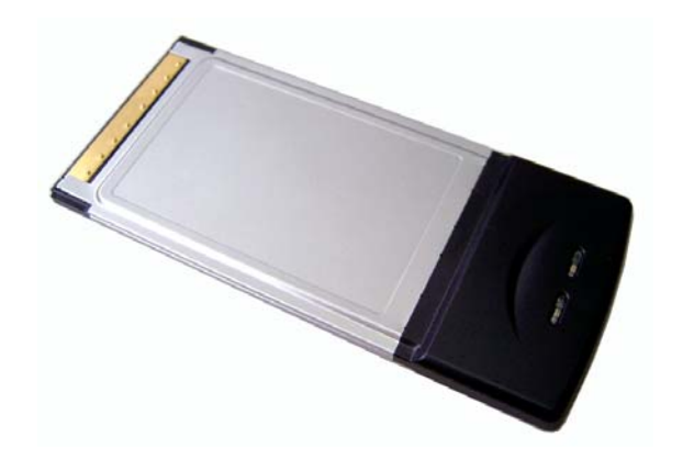
Figure 1-1 WCB-G03H Appearance