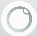
Ceiling mount base