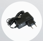
24V 0.38A Adapter