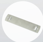
Ceiling mount attachment