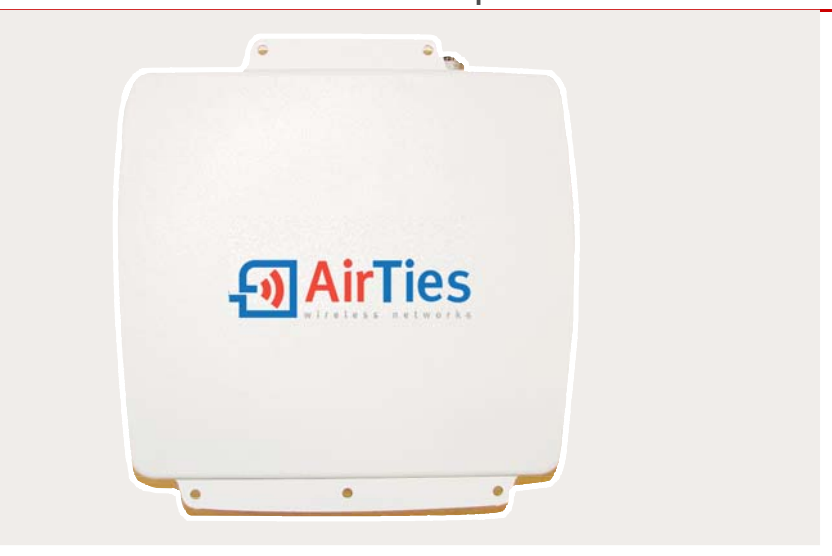
Outdoor Wireless Communications Between Buildings!